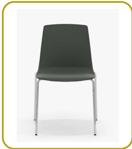
Arlo Side Chair

In accordance with EN 15804+A2 and ISO 14040 / ISO 14044