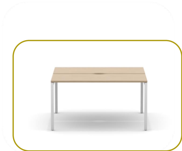
Aspen Bench- ASDCD14-2

In accordance with EN 15804+A2 and ISO 14040 / ISO 14044