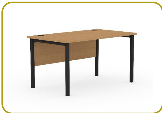
Aspen Quad- ASQD14

In accordance with EN 15804+A2 and ISO 14040 / ISO 14044